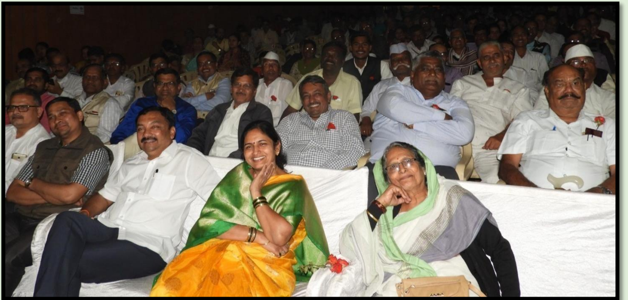
Padmashree Karmaveer Kakasaheb Wagh Lecture series - 12 January 2018, 'Hasyakallol' Audience attending the event